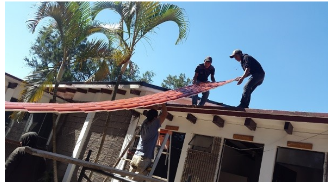
Working on the new roof for the Library