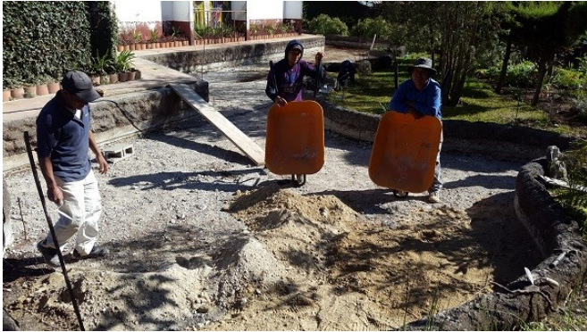
Rebuilding the Moat around the main Chapel

The moat around the main chapel relates to the spirit of Exodus and symbolically when crossing the moat into the chapel, represents passing from the worldly realm into the spiritual realm.