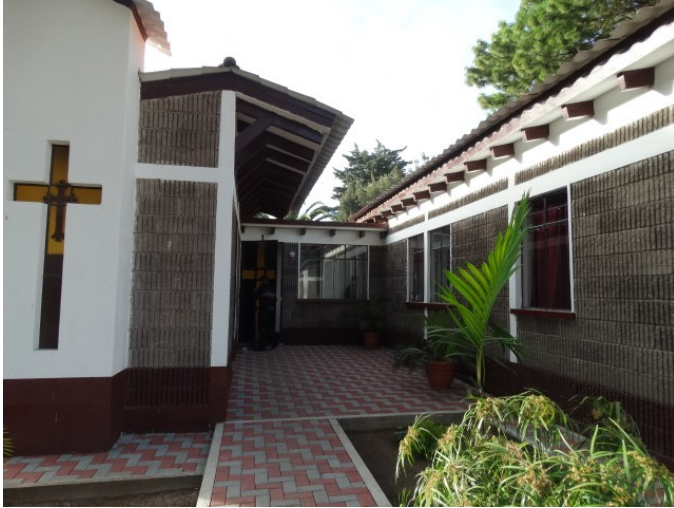
Seminarians house entrance

The walkways between dormitories have been repaved. The original paver block disintegrated over time due to sun and rain damage as well as roots from nearby trees. We are happy to report that these walkways have all been repaired.