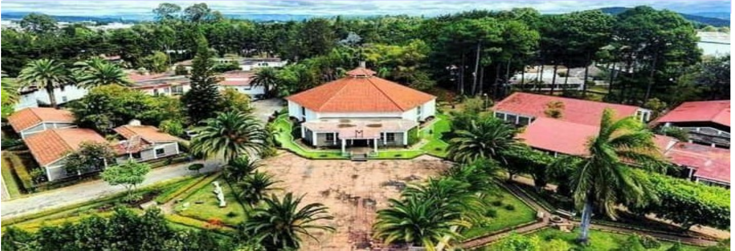
Photo: Seminary of the Fraternity in Guatemala City

Through the generosity of our benefactors over the past three years we have been able to address many needed infrastructure repairs at our seminary in Guatemala City. Most of our buildings, walkways and utility infrastructure were built in the mid-1980s. Over the past 34 years we have done our best to maintain our facilities while devoting most of our financial resources to the formation of our seminarians and to the operation of our mission parishes. Three years ago it became evident that we could no longer ignore many needed repairs. As a result we prioritized a renovation plan and are happy to report that through the truly generous support of our benefactors we have been able to address the most needed of these repairs.