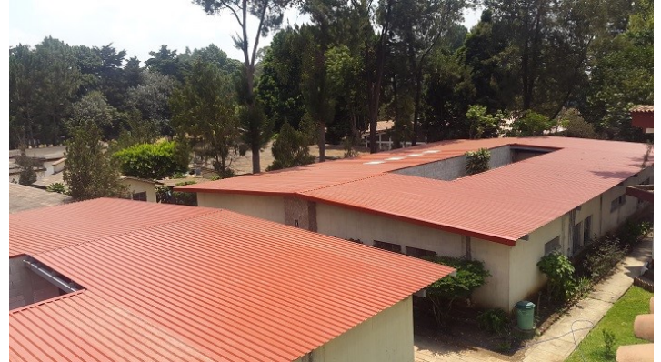
Seminarians Houses, from the old to the new roofs