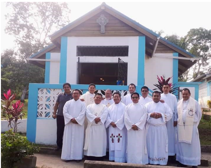
Priests of the Fraternity with Novices at the entrance of the Novitiate