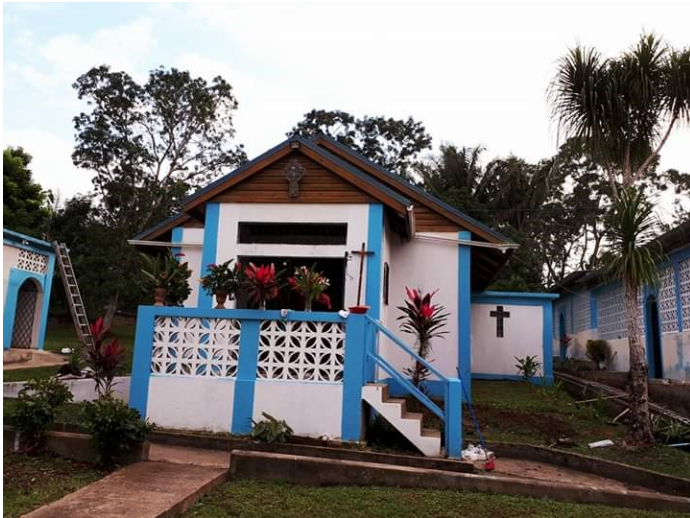
Chapel of the Novitiate in Belize

In our previous newsletter we reported on the experience of Novitiate which our seminarians began in Belize last year. Buildings to accommodate the novitiate were donated but required significant renovation prior to occupancy. We received tremendous support from benefactors in the United States which allowed us to renovate novices' rooms, the dining room, provide new beds and kitchen equipment as well as upgrade the electrical system.