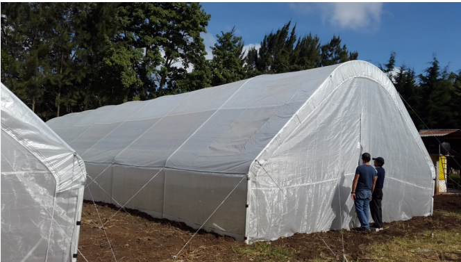
Tecnicos adjusting the entrance

Food expenses in the Seminary represent about 18% of our annual budget. With the support of Caritas in Guatemala, we installed two Green houses. Now at the Seminary grounds we are able to produce our own vegetables (tomatoes, onions, lettuce, cucumber, chilli pepper, etc ).