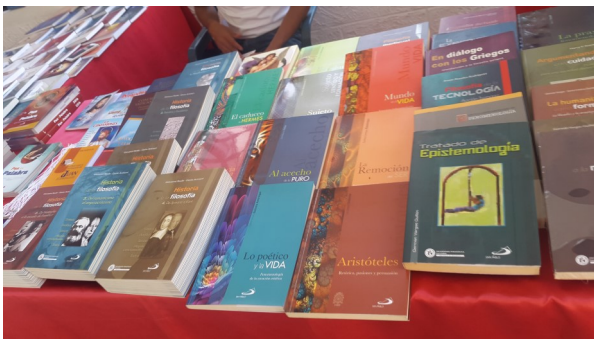
Our library with new books for our seminarians