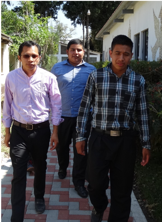
Seminarians on the walkway at the Seminary in Guatemala