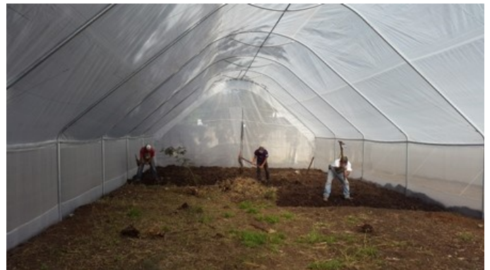
Preparing the soil