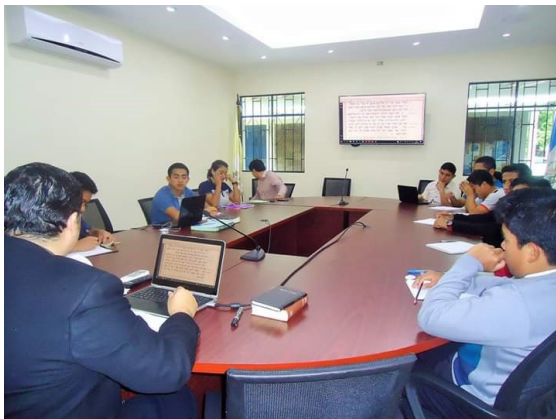
Students at the multimedia room

Our goal is to provide a high level of education for our students. With the multimedia room our students can have video conferences on line with teachers and students in other countries.