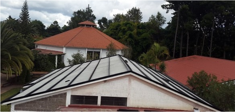
Administration Building, roof replacement

In Winter as much as 10-15" inches of rain can fall in a single day. The rainy season is from May through September. This results in deterioration of common roof materials used in Guatemala.