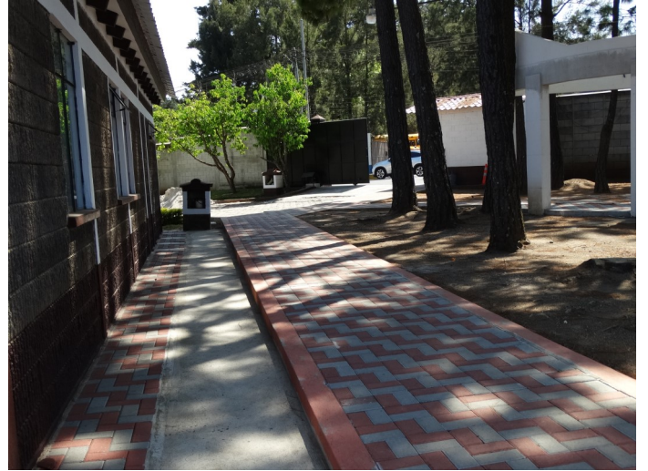
Walkway at the entrance of the Seminary