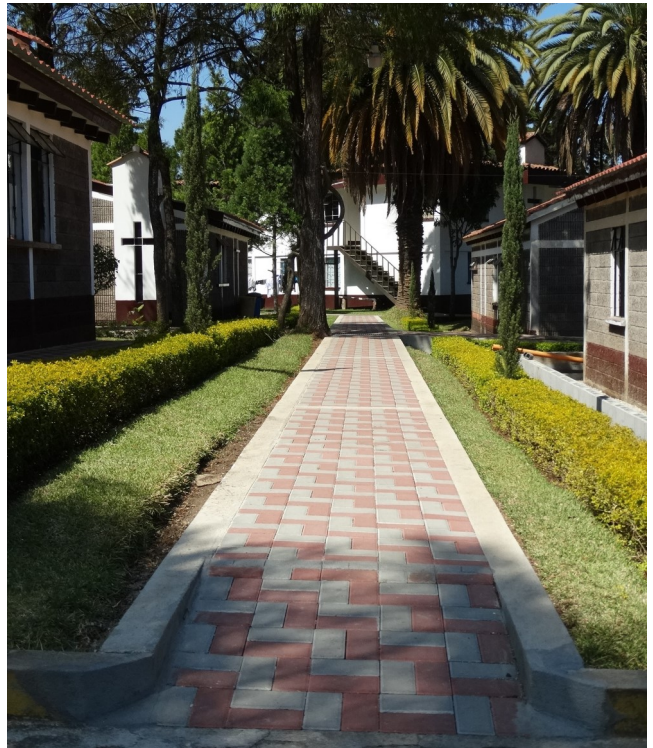
One of the pathways between the houses